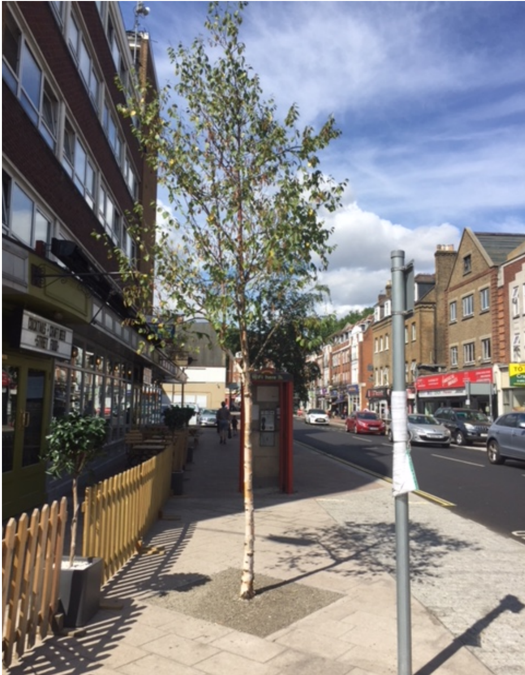
Tree Outside Kelsey House