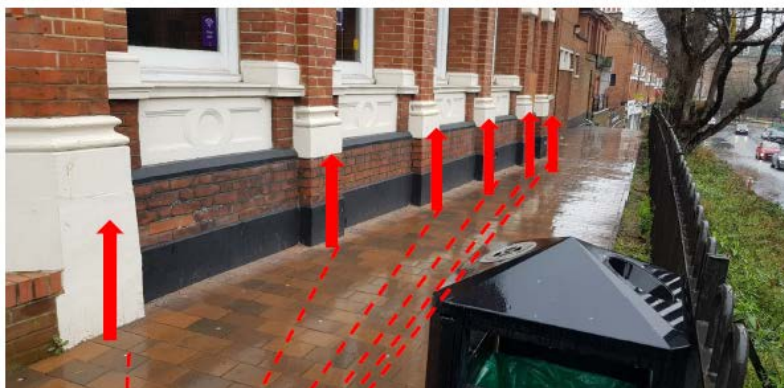
Meyer Uplight 200, Rotationally Symmetrical narrow beam – 5 x Led 1W warm white 3000k , 6no. Luminaires to sit inside a concrete recessed liner, provided by others